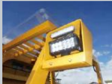
Highly visible LED lamp installed

OUR FORKLIFTS WORK WHERE WHEELED-TYPE FORKLIFTS CANNOT ACCESS.