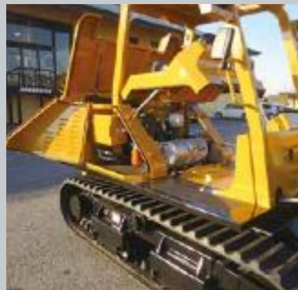
Easy inspection and maintainability