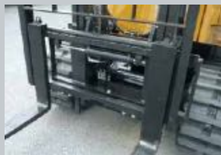
Side shift available